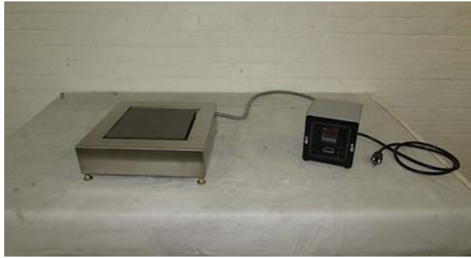
(上图) 型号 HP99YH 带有不锈钢板和“D”远程数字恒温器控制，最高操作温度为 1,000F (537C)。