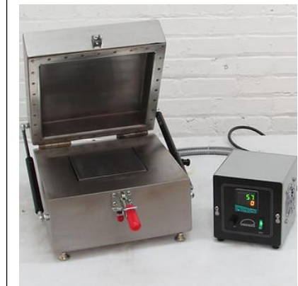
(下图) 型号 HP66YX 配有可选绝缘罩。