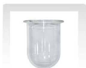
圓底燒杯 Round Bottom Flask 6 PCS