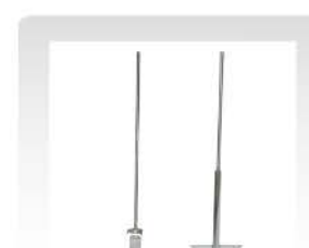
攪拌棒 / 槳式攪拌棒 Rotation Shaft Paddle Shaft 6 / 6 PCS