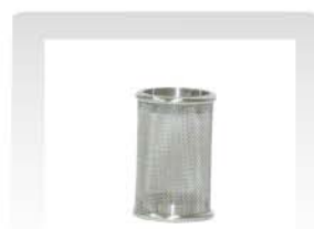
網籃 Basket 6 PCS