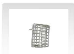
線籃 Sinker 6 PCS